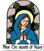
May: The month of Mary

Use TWINKL to learn about Mary and how to create a May Altar – something you can do at home if you wish.